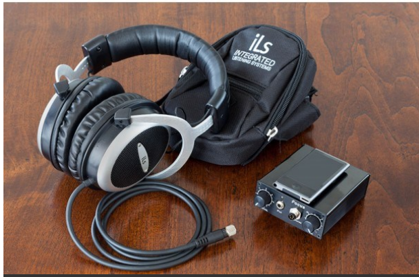
iLS Student Focus System for School Program use